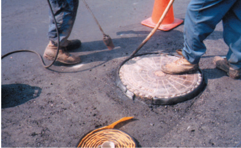
Application to asphalt/steel road structures.