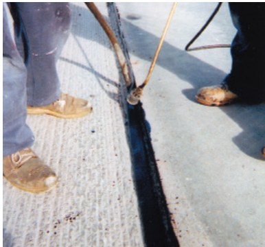
Application to asphalt/concrete airport runway.