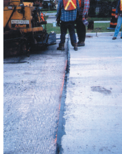
Application to asphalt/asphalt road